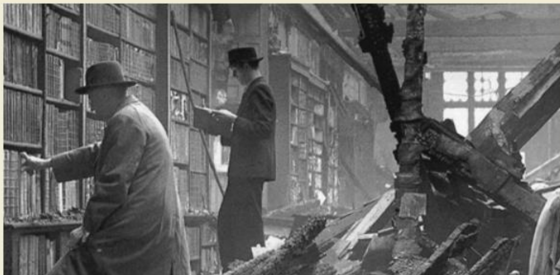
Interior view of the Holland House in Kensington, London after bombing (1940)

Home » Activities and Groups » IFLA Risk Register